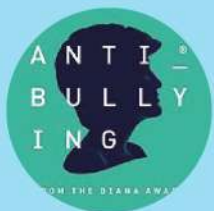
Anti Bullying Ambassador