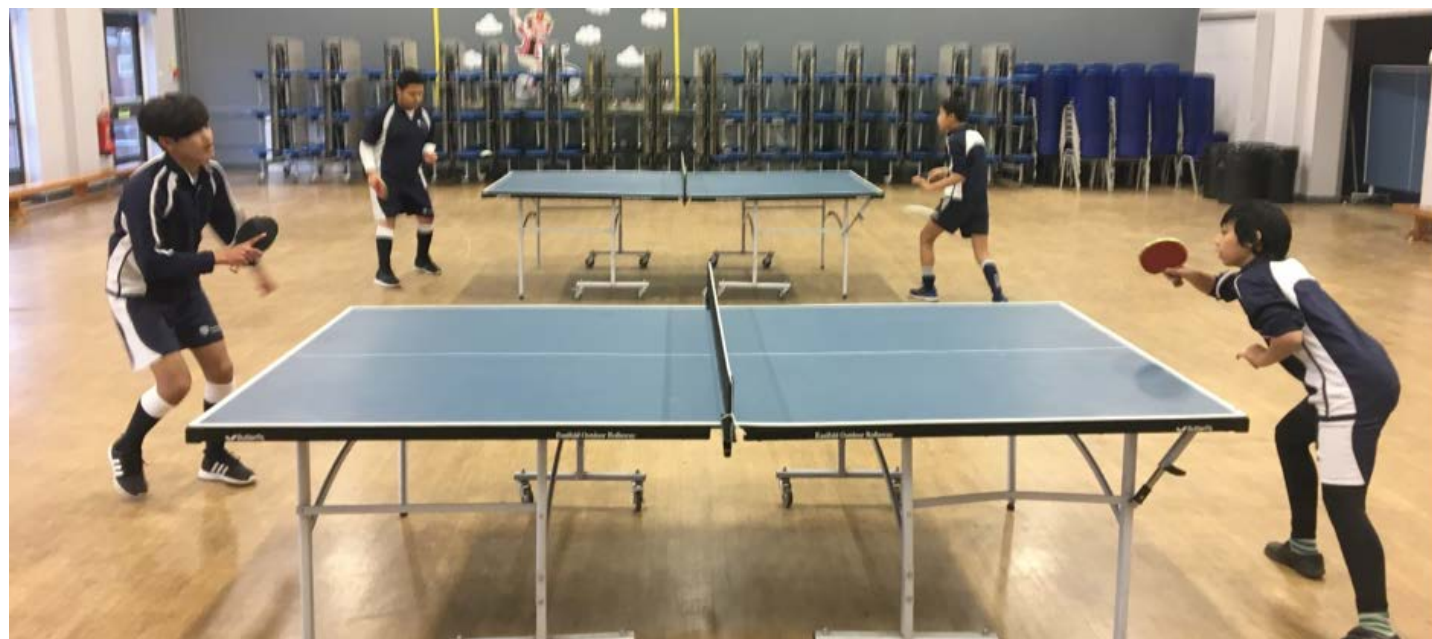
Table tennis has really taken off at Etone college. We have been having lots of students attending the satellite club and staying on until 5pm on Thursday nights. 5 of the students were selected to enter the local town championships on the 2nd February. Out of the 5, 3 of them reached the finals in the under 15's categories. One student came runner up in the singles competition and the other two students came runners up in the doubles competition. Congratulations to all those students that entered.