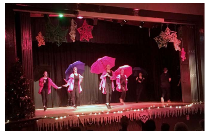
Last year's performers dancing to Singing In the Rain.

We have the Matrix Dance Show in March with a number of Year 7 and 11 students performing. This is where all schools in the Matrix have been invited to perform. We are holding the showcase here at Etone College this year. This is a great opportunity for pupils to show their talents.