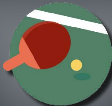
Table Tennis Takes off at Etone

Table tennis has really taken off at Etone college. We have been having lots of students attending the satellite club and staying on until 5pm on Thursday nights. 5 of the students were selected to enter the local town championships on the 2nd February. Out of the 5, 3 of them reached the finals in the under 15's categories. One student came runner up in the singles competition and the other two students came runners up in the doubles competition. Congratulations to all those students that entered.